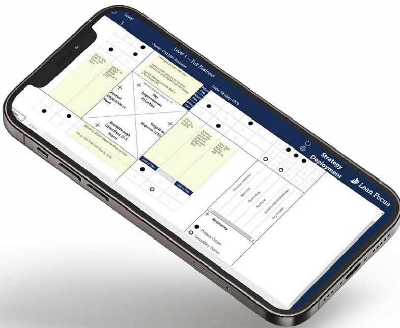
Strategy Deployment App Matrix

As you know, multi-level Strategy Deployment creates enormous value, but it requires a lot of data, documentation, etc. which has the potential to create errors or waste. It also coordinates the complex activities of many people, and each level is dependent on the level below, creating even more moving parts.